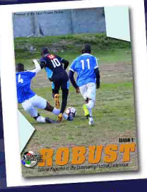
Free eMagazine "ROBUST"