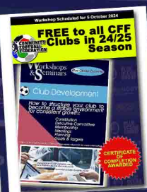
Free Club Development Workshop

What does the CFF offer your club this upcoming 2024/25 Season?