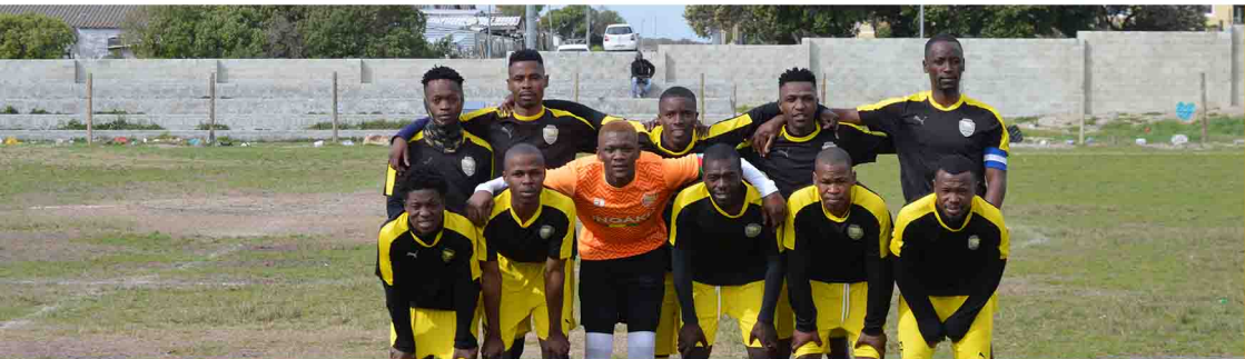
Zama Zama FC won the League and Legacy Cup in the 2024 season.

Our 5 year goal is to grow the team to an Academy where we will have different age groups and develop them into bright future soccer players. We want to have more to have full development of our players and hopefully